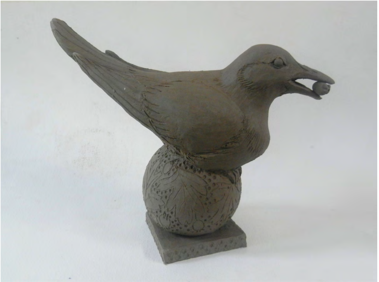
'Mistle Thrush with Hawthorn Berry' – Unfired stoneware by Hilary Audus