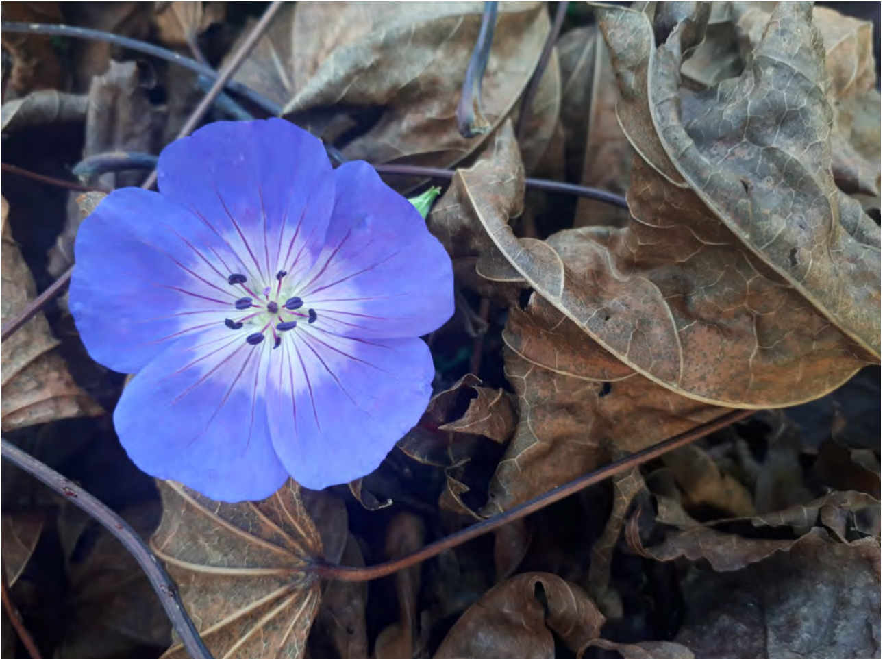
'Brazenly defying Autumn'