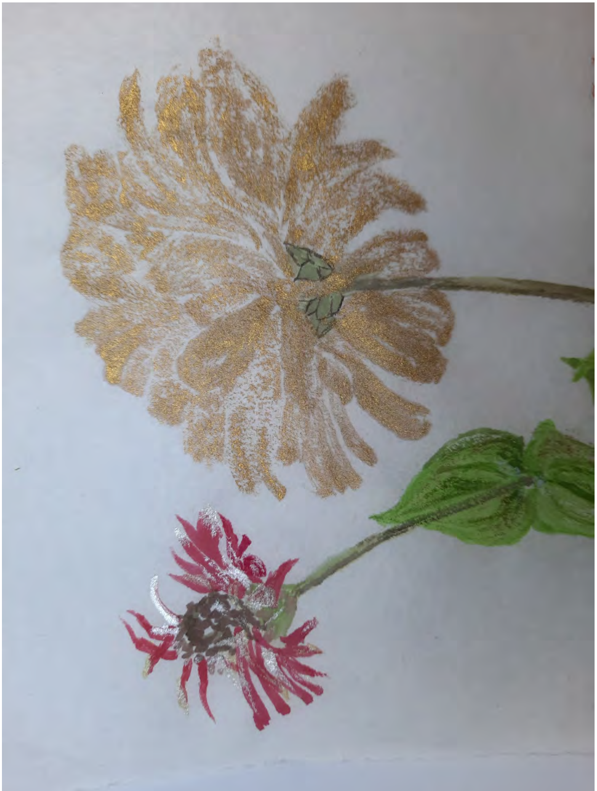
'Fading Glory' – Watercolour on rice paper by Pamela Wood