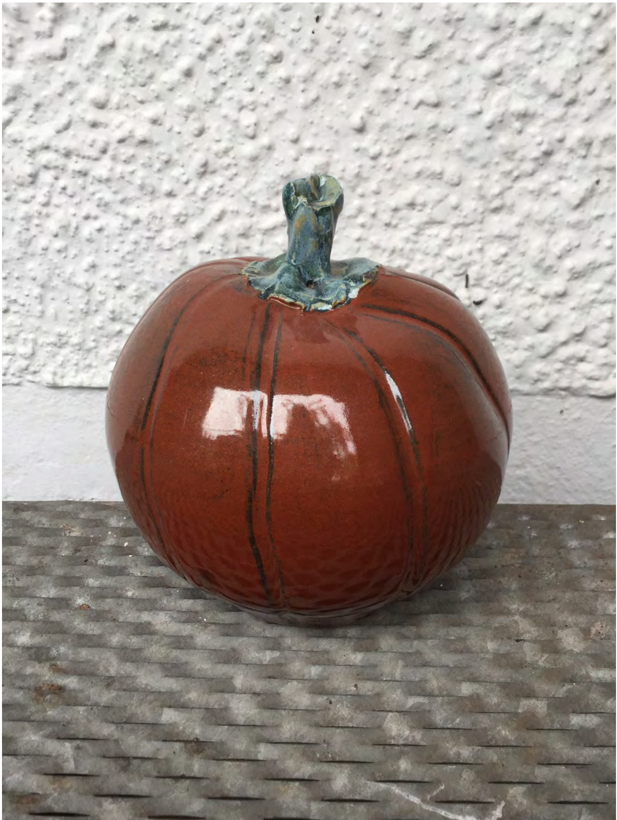
'Pumpkin' – Glazed stoneware, 15cm tall by Carol Read