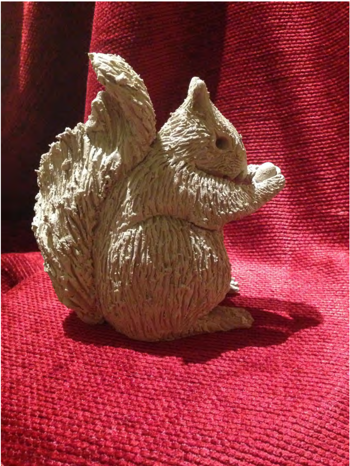
'Squirrel' – Un-fired Stoneware by Isobel Cherry