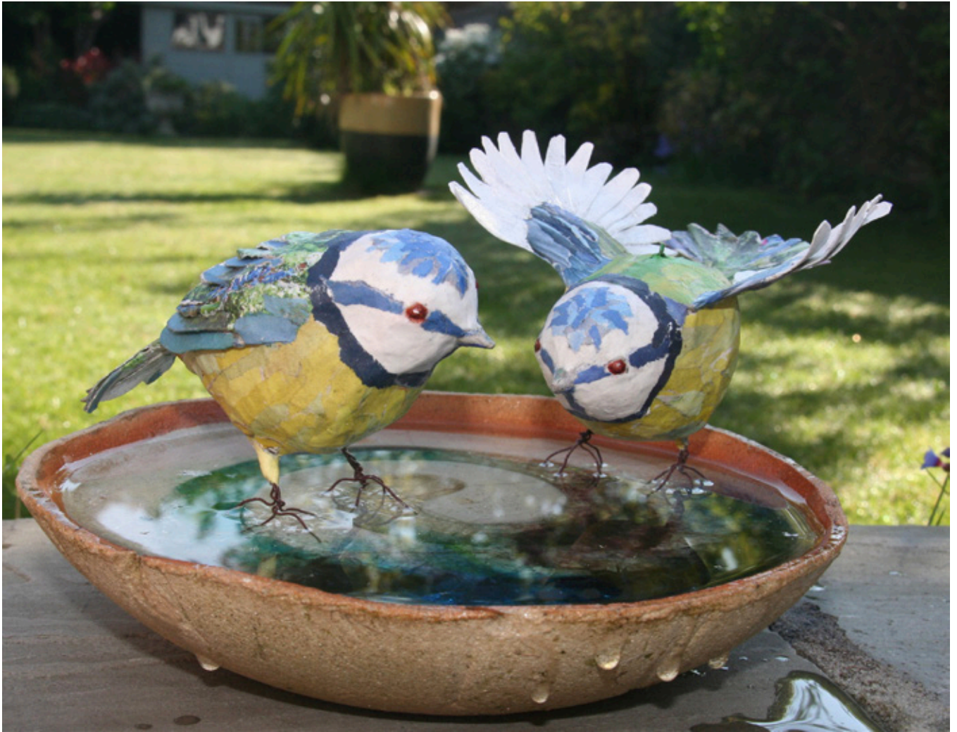
'Bathing Blue Tits' – Papier-Mâché, Découpage & Wire, Stoneware Birdbath Yvonne Cornes