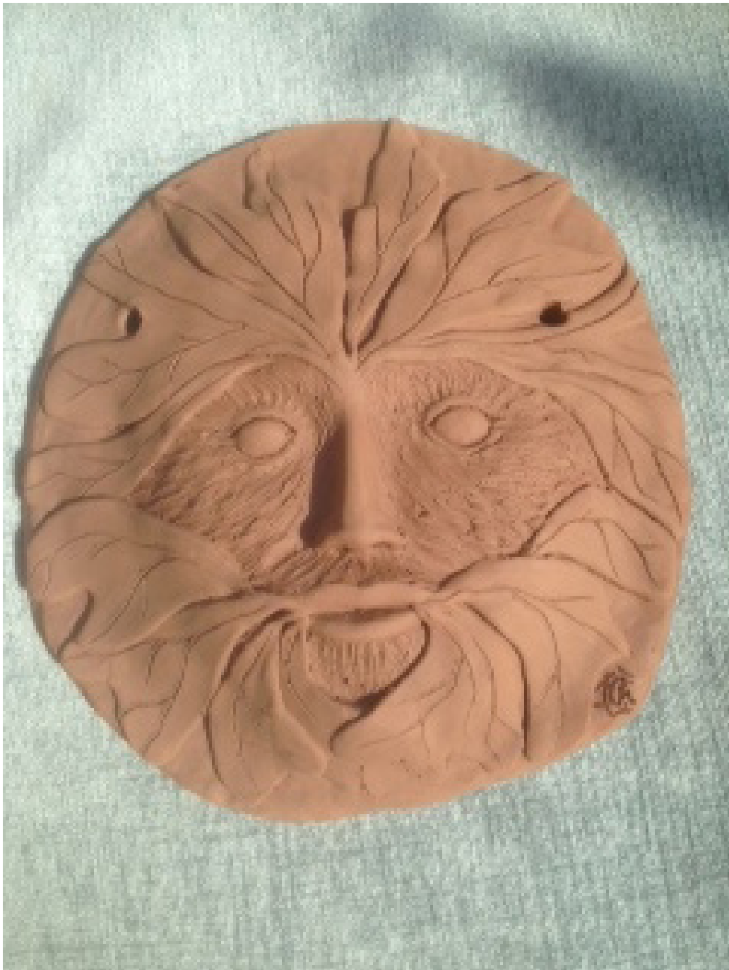
'Green Man' – Unfired Garden Terracotta Isobel Cherry