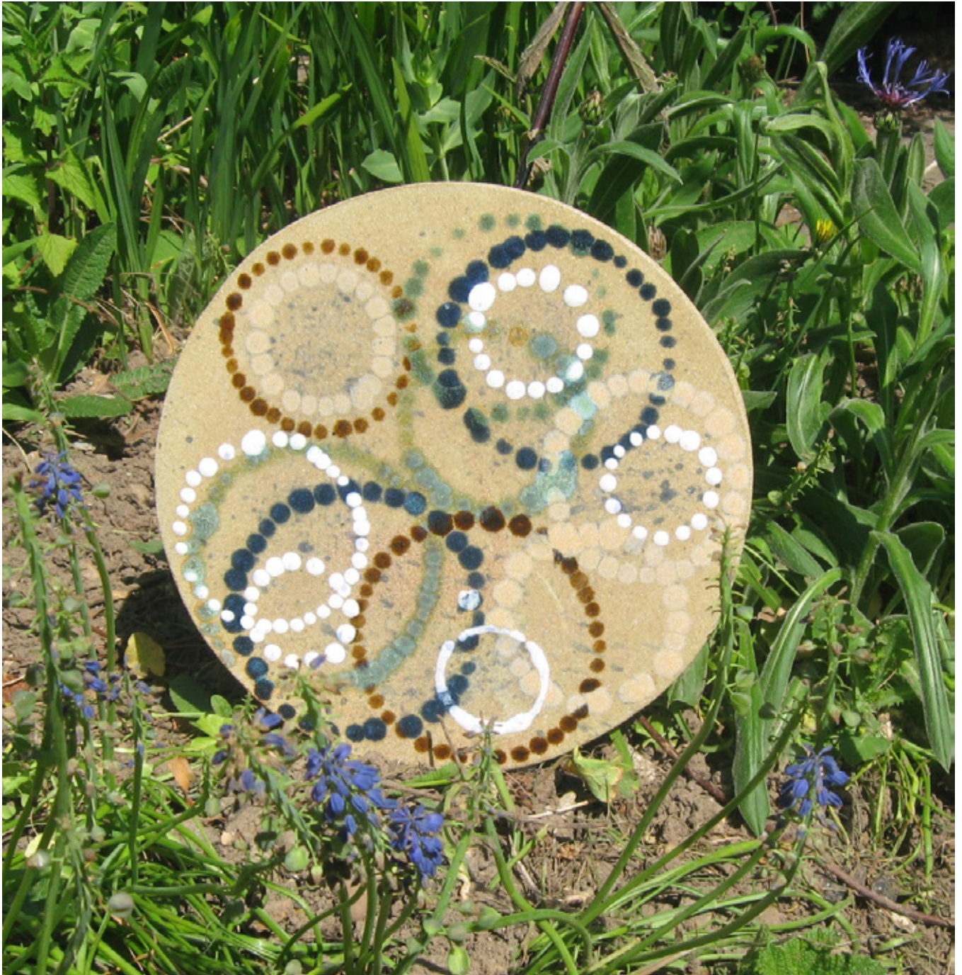
'Stoneware Disc' – with slip trailed glaze “flowers” Max Cowlin