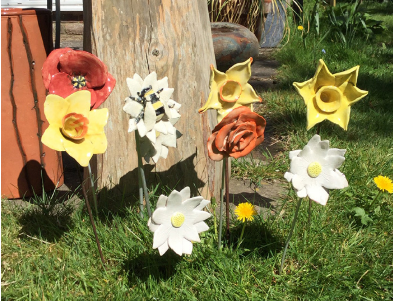
'Ceramic Flowers' – on metal rods Carol Read