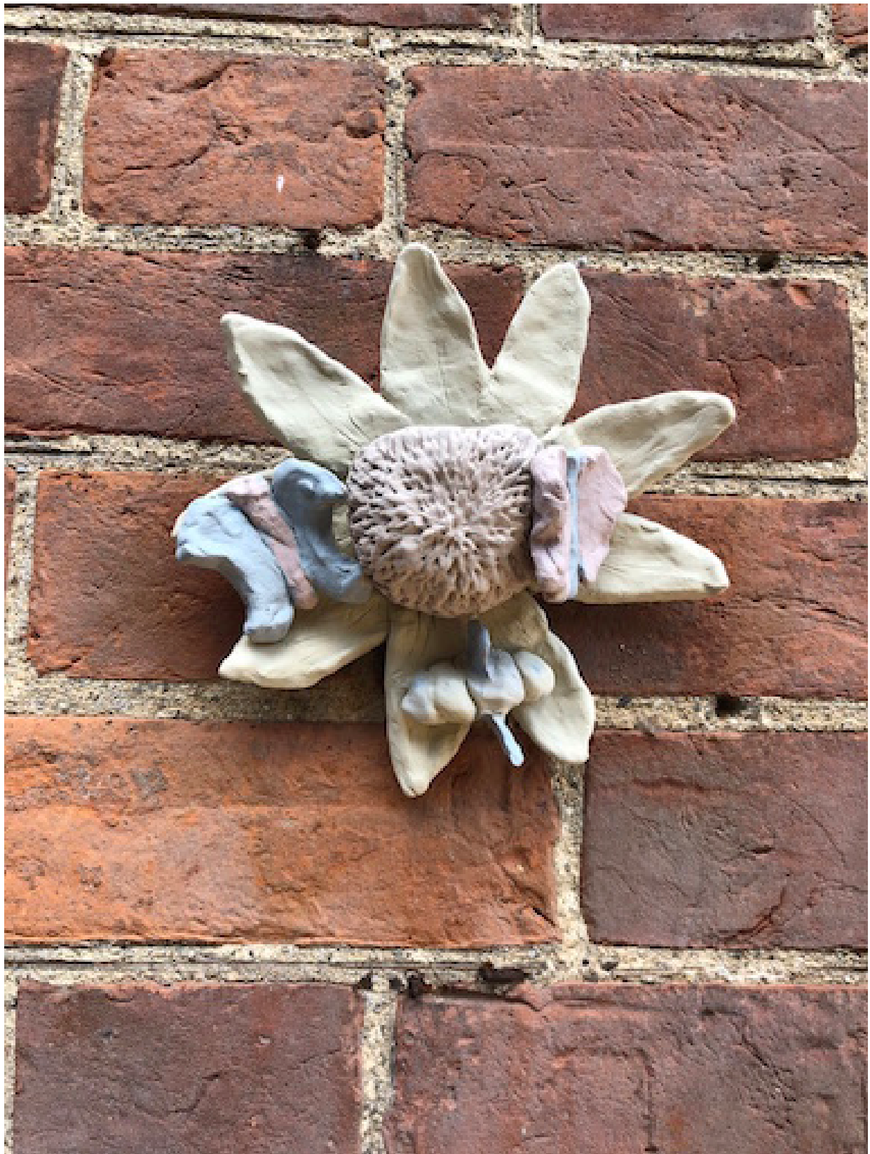
'Sunflower, Butterflies & Bee Wall Planter' – Unfired White Stoneware with coloured slip Arthur Hoyle