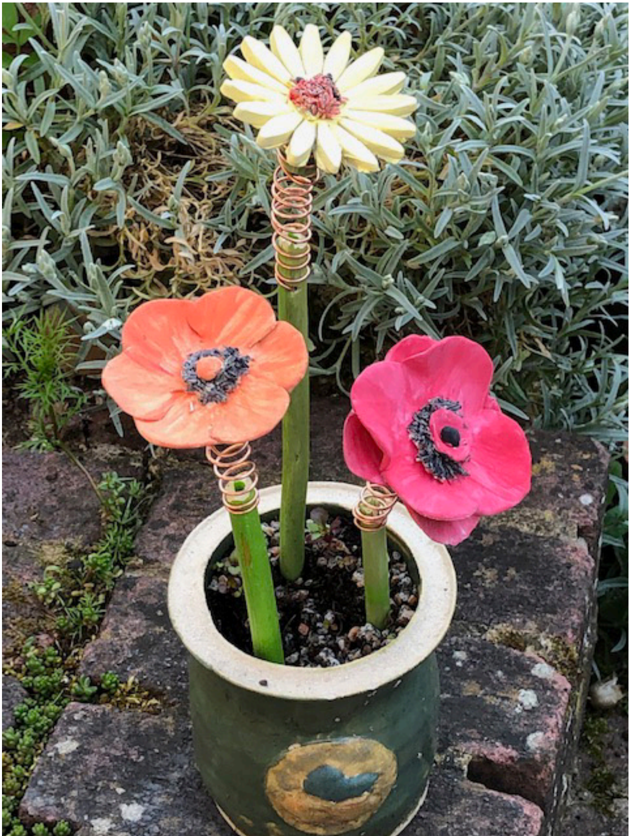
'3 Flowers' – Fired Clay, Acrylics, Wire & Bamboo Jane Ostler