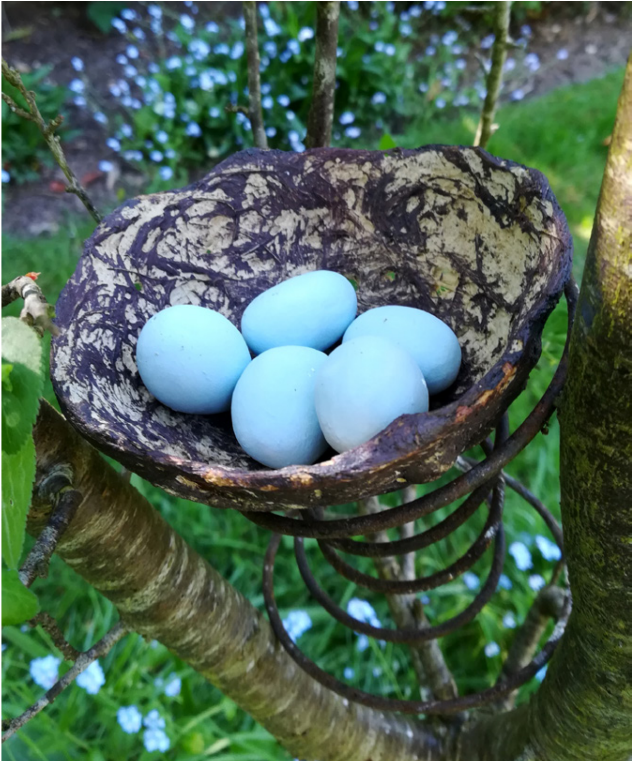
'Nest and Eggs' – Stoneware & old bedspring Dorothea Reid