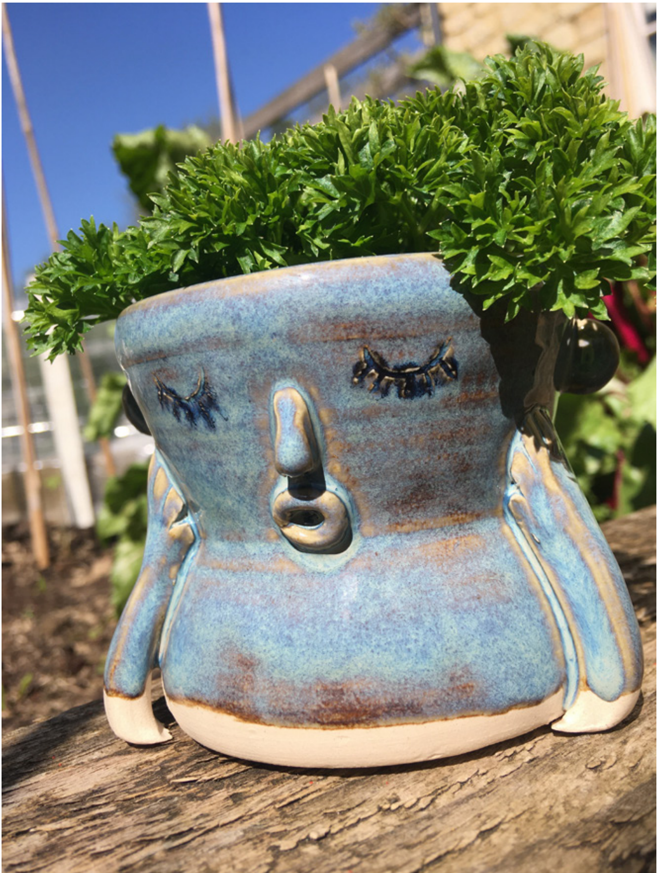
'She' is 'Parsley' the Planter – thrown & embellished stoneware Sally Foan