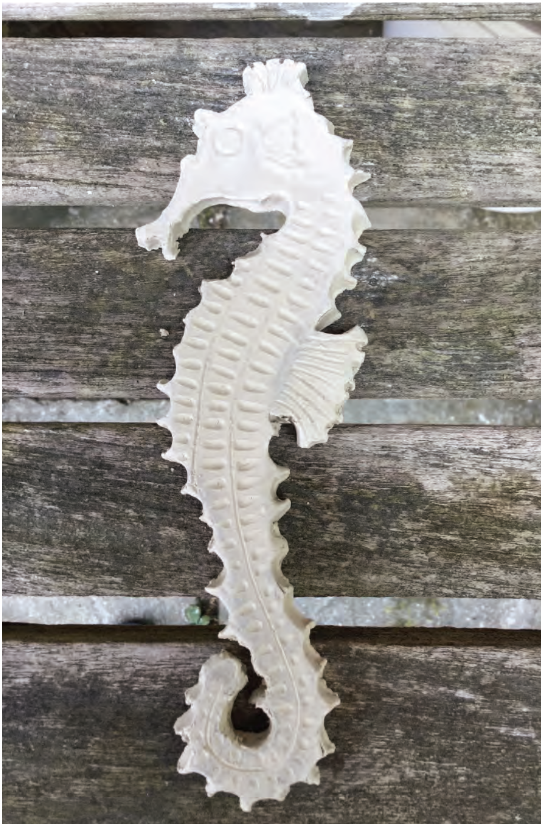
'Seahorse' – Unfired stoneware Carol Read