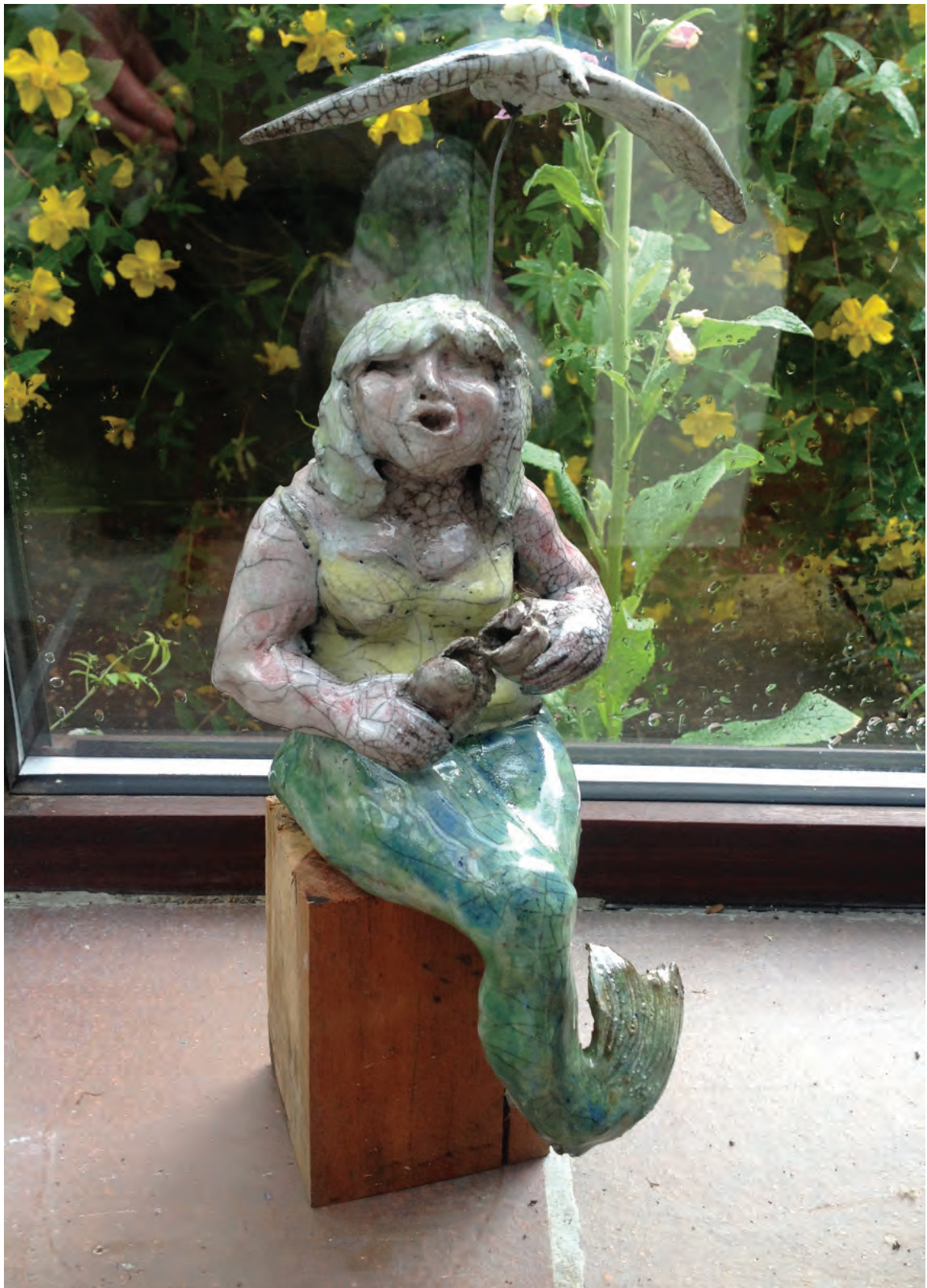
'The pastie eating mermaid' – Raku fired on wood Archie Morton