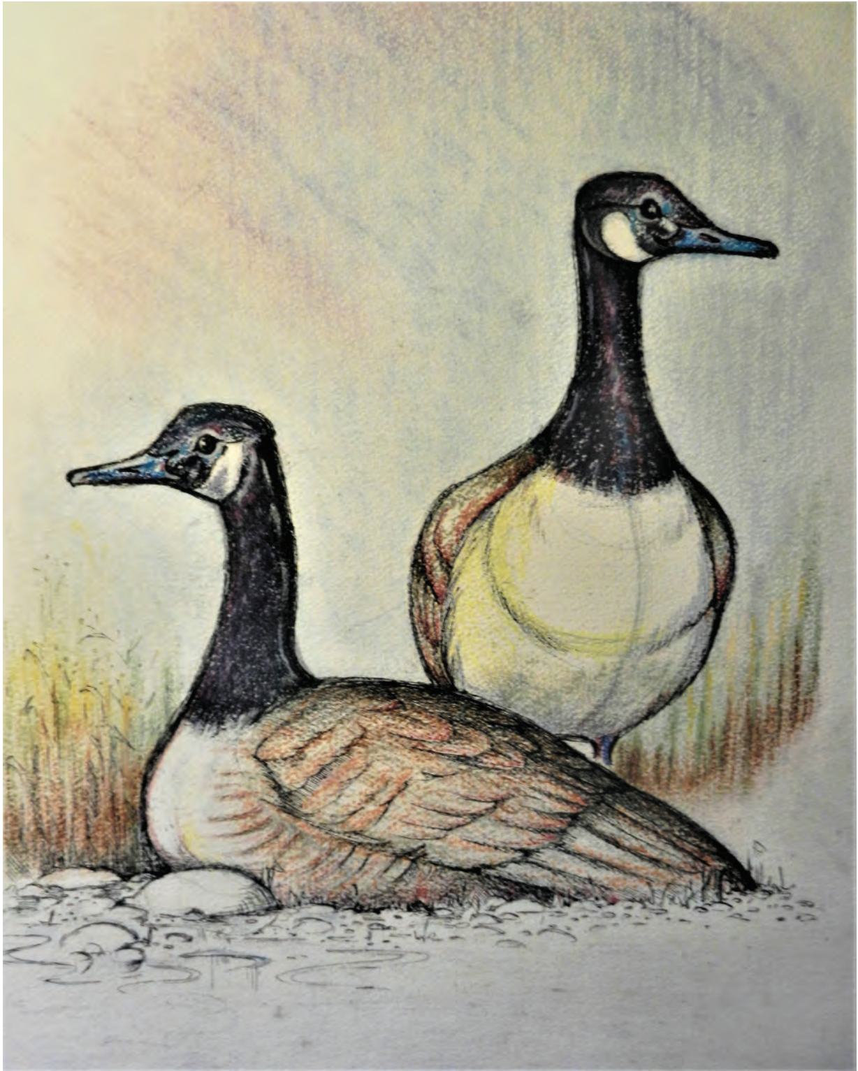
'Canada Geese' – Mixed media Hilary Audus