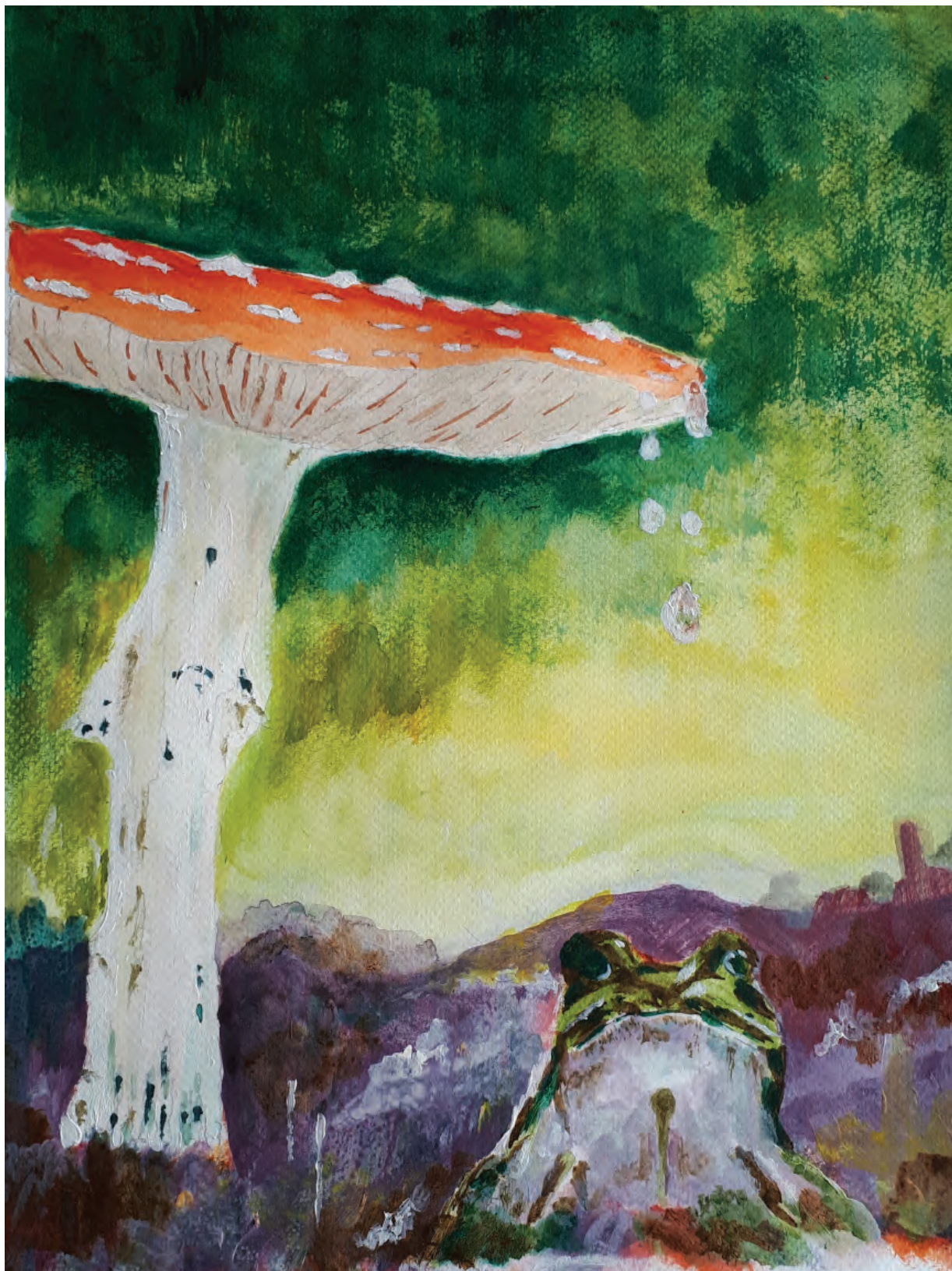
'Time for a Splash' – Painting, Acrylics Colin Wood