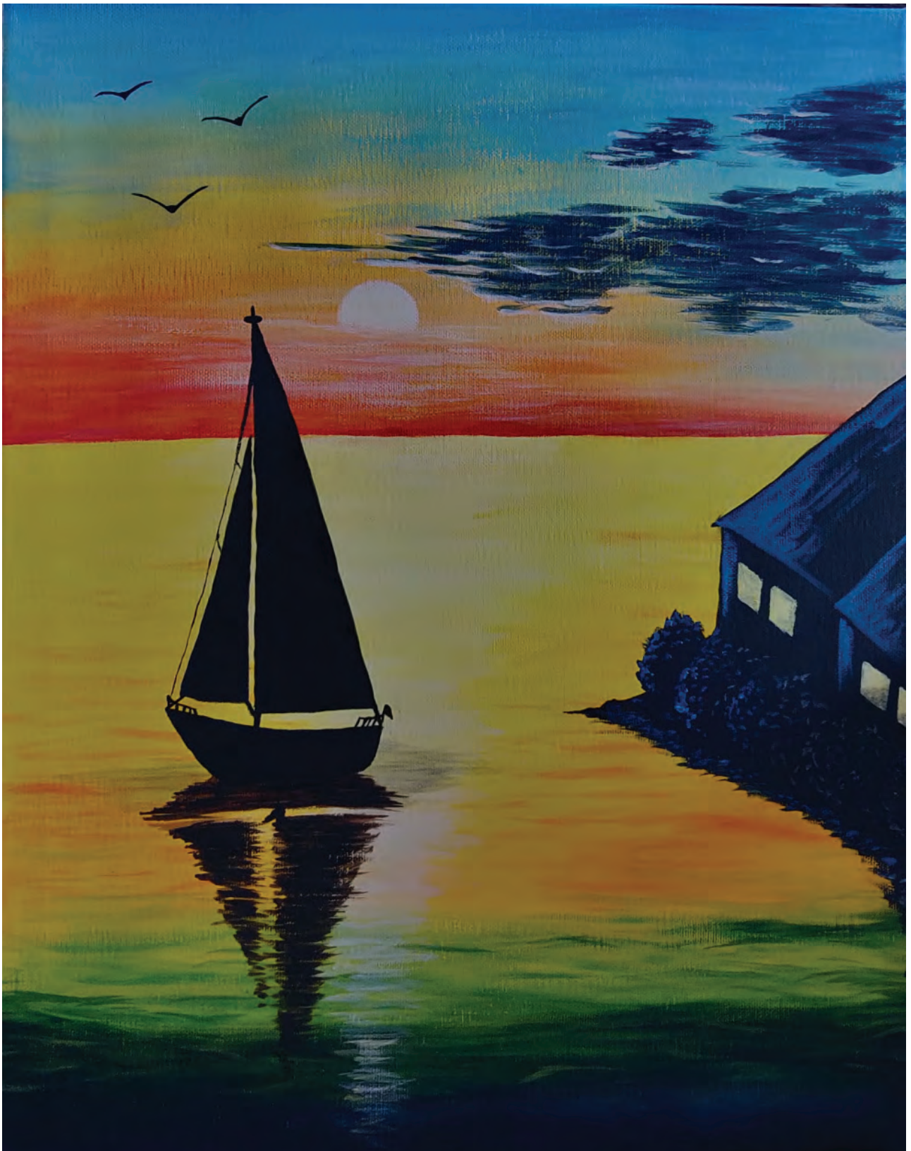
'Maggie's Dream' – Acrylic on canvas Molly Myhill