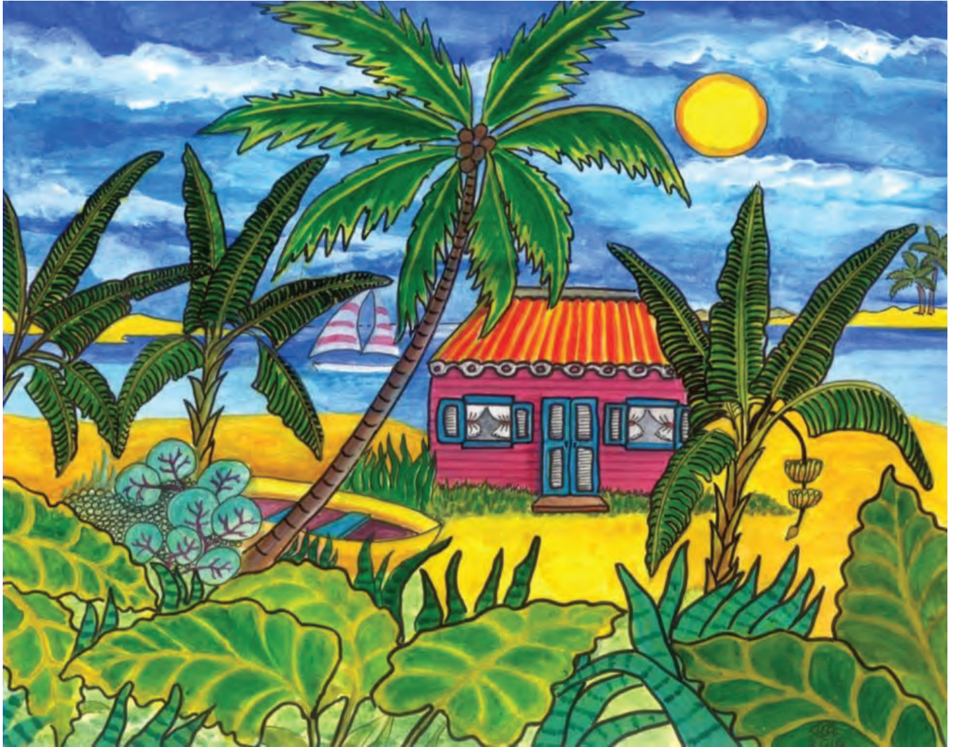
'Living by the Sea' – Painting, Acrylics Isobel Cherry