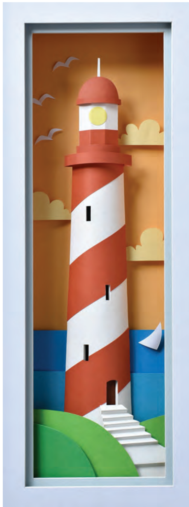
'Candy Striped Lighthouse' – Paper sculpture Graham Lester