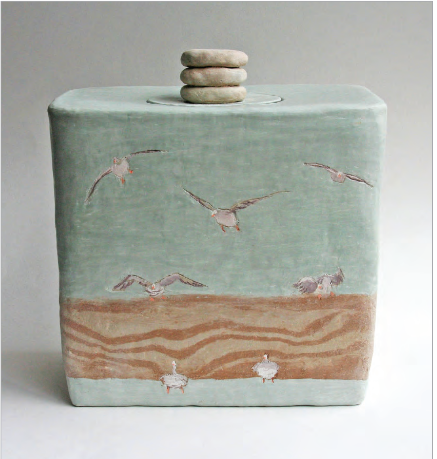
'Water Approach, White-fronted Geese' – Unfired lidded pot with slip and underglaze Yvonne Cornes