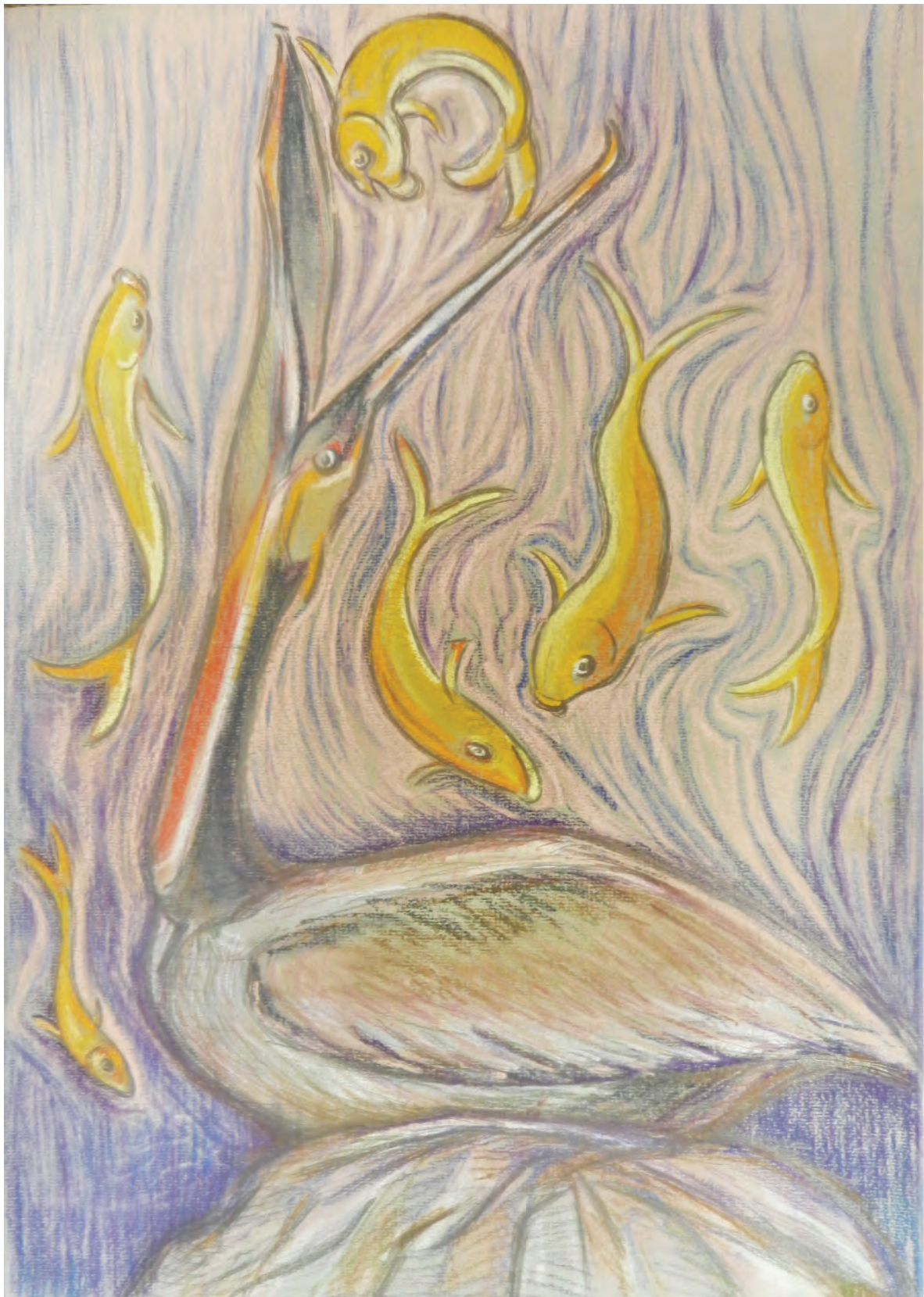
'Pelican and Fish' – Pastel Hilary Audus