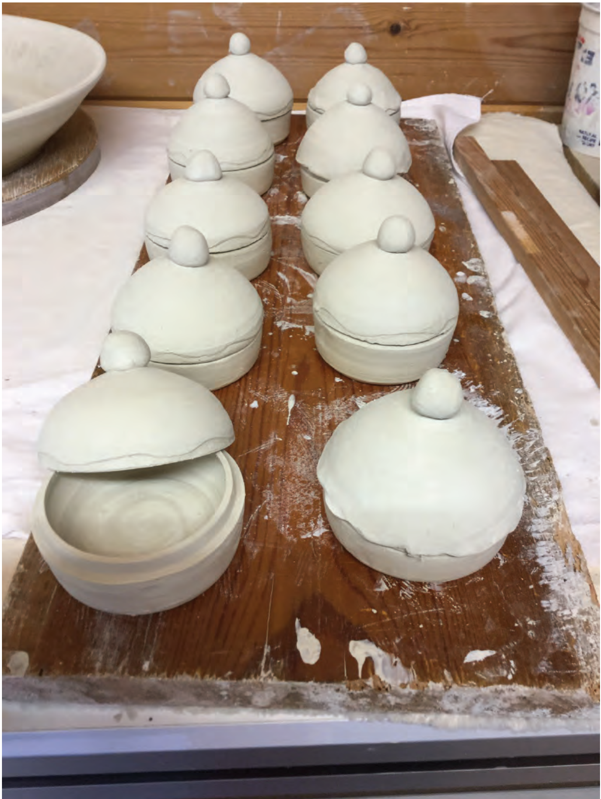
'Lidded cupcakes' – Leather hard stoneware, 5-6 cm approx Carol Read