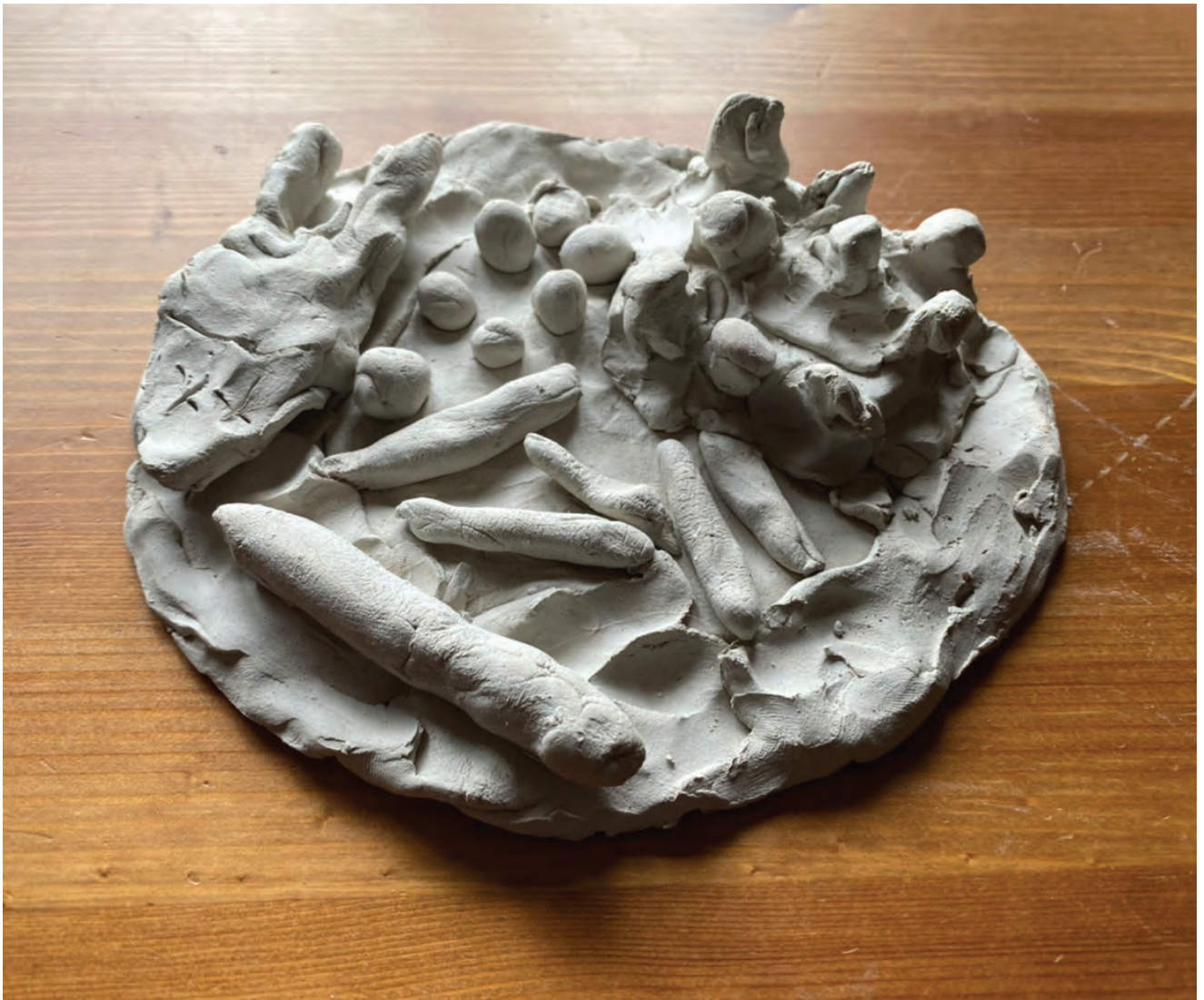
'Fish and Chips' – Unfired white stoneware Atticus Hoyle