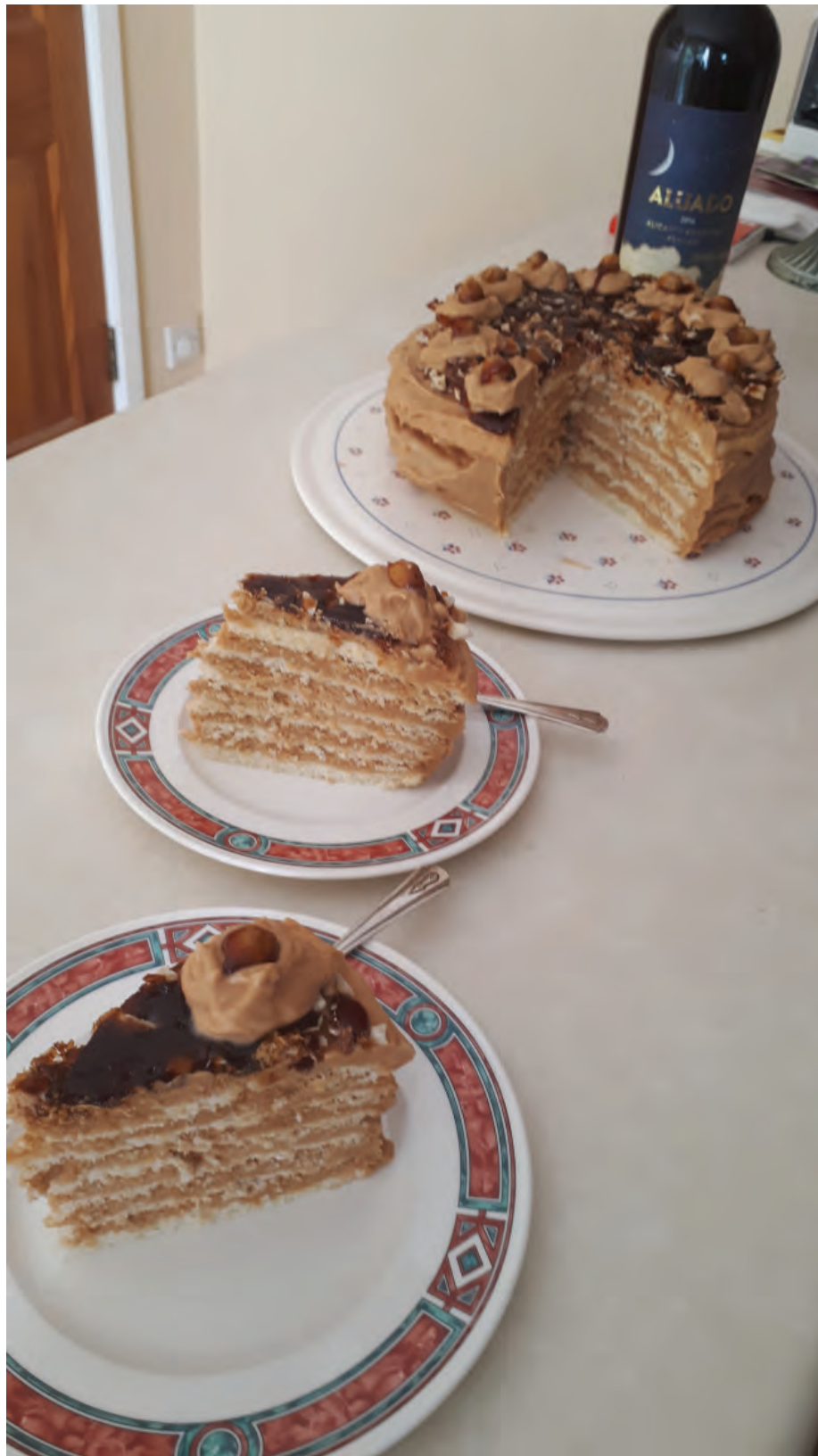
'Dobos Torte' – Sculpture in sugar, butter and cream Pamela Wood