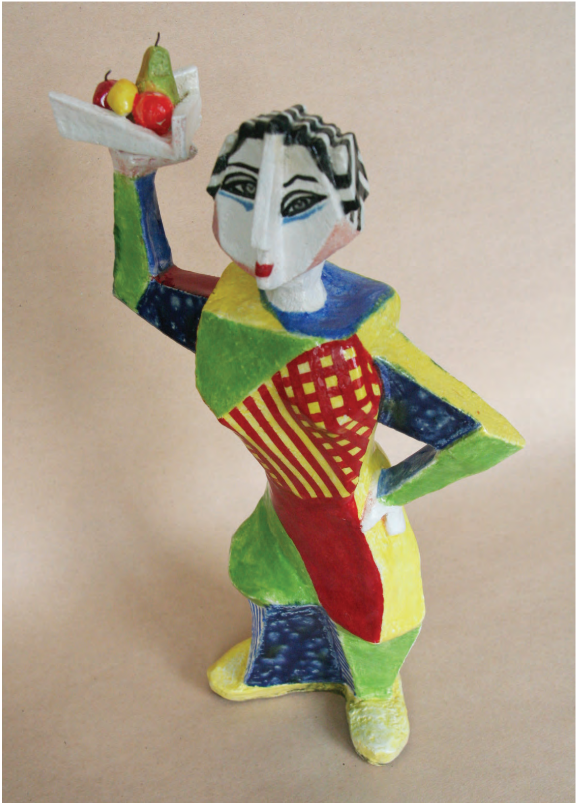
'Ooh là là, le fruit!' – Stoneware with underglaze and glazes, wire for fruit stalks Yvonne Cornes