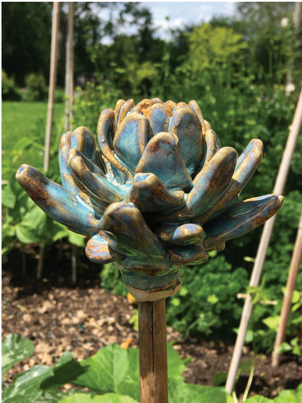
'Artichoke' – Glazed stoneware Sally Foan