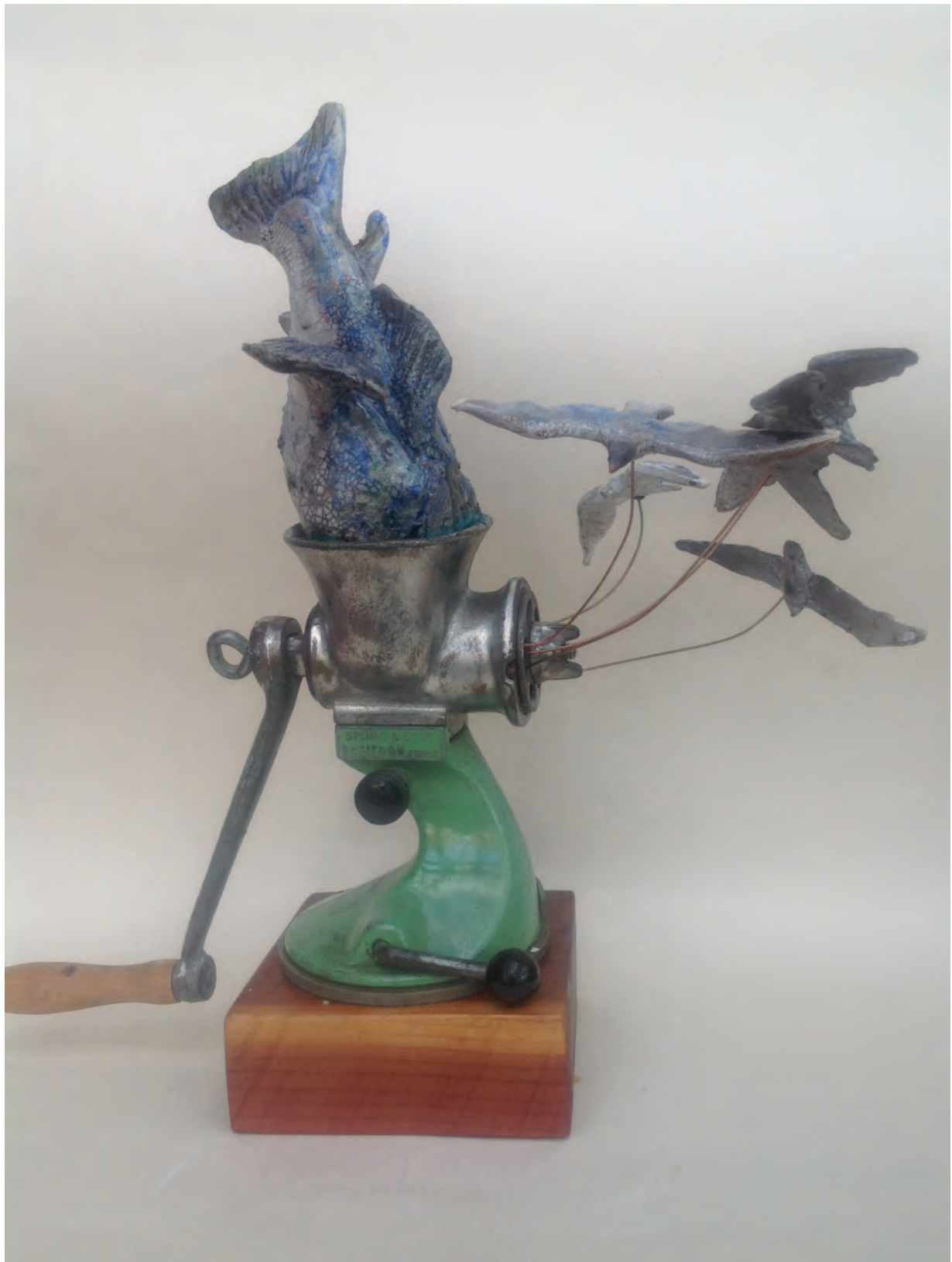
'Fishing quota' – Meat grinder, wood and raku 35x30x15cm Archie Morton