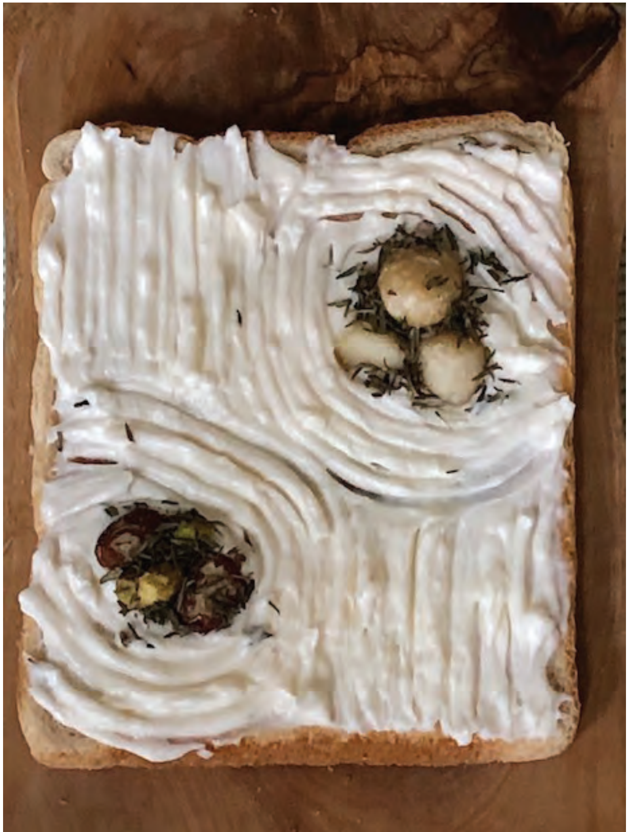
'Edible Japanese zen garden' – Bread, mayonnaise, macadamia nuts, & crushed herbs Jane Ostler