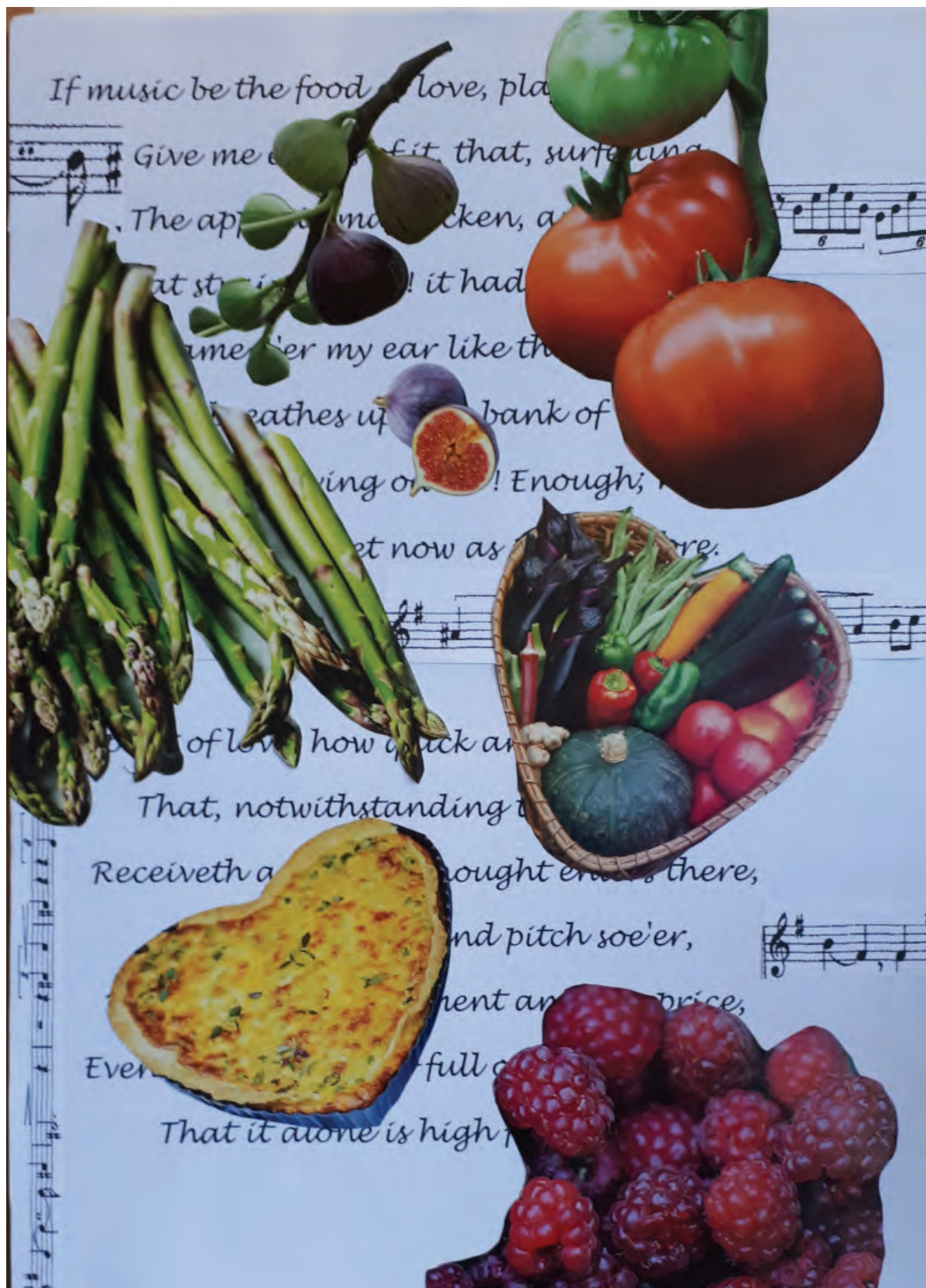
'Food, Romance and Music' – Collage Colin Wood