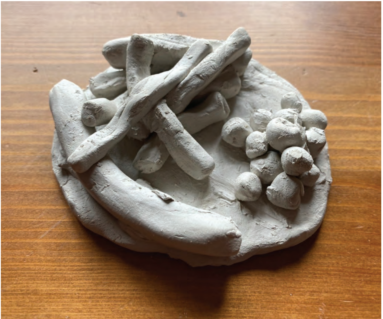
'Sausage and Chips' – Unfired white stoneware Arthur Hoyle