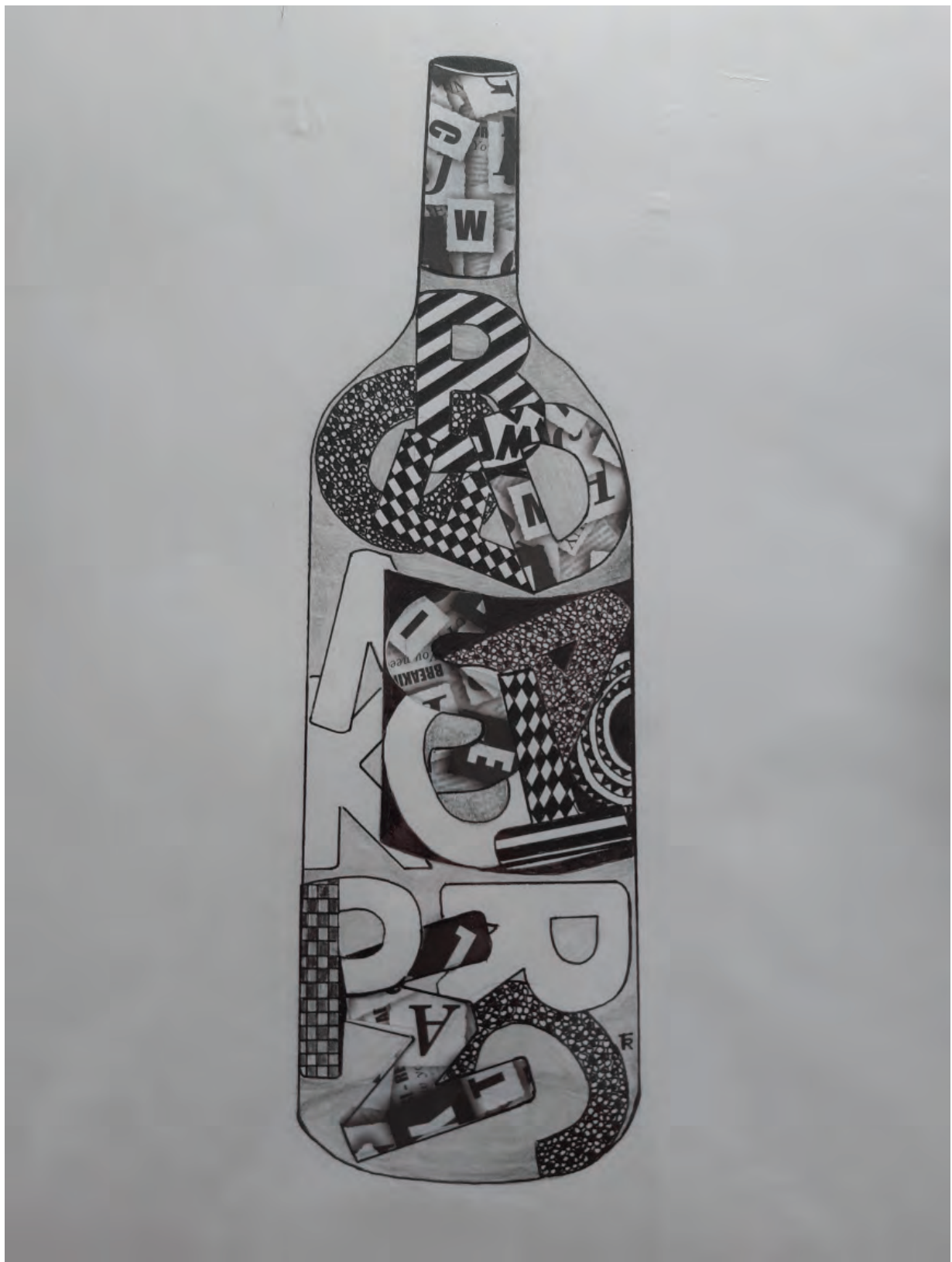
'Food of the Gods' – Pen and ink drawing Frances Reynolds