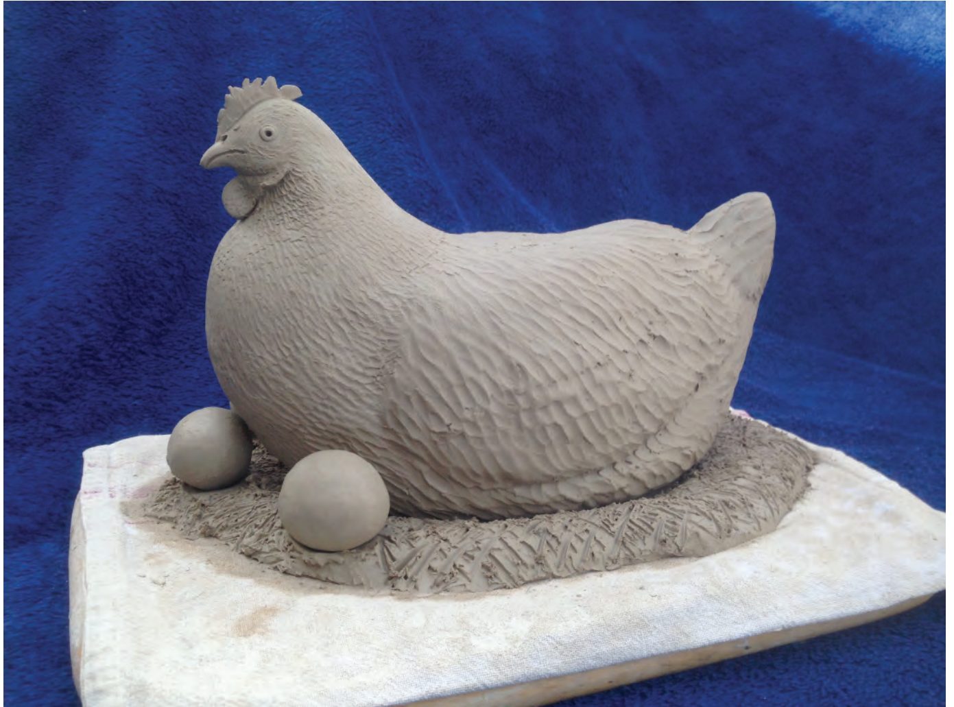
'Chicken with eggs' – Unfired stoneware Isobel Cherry