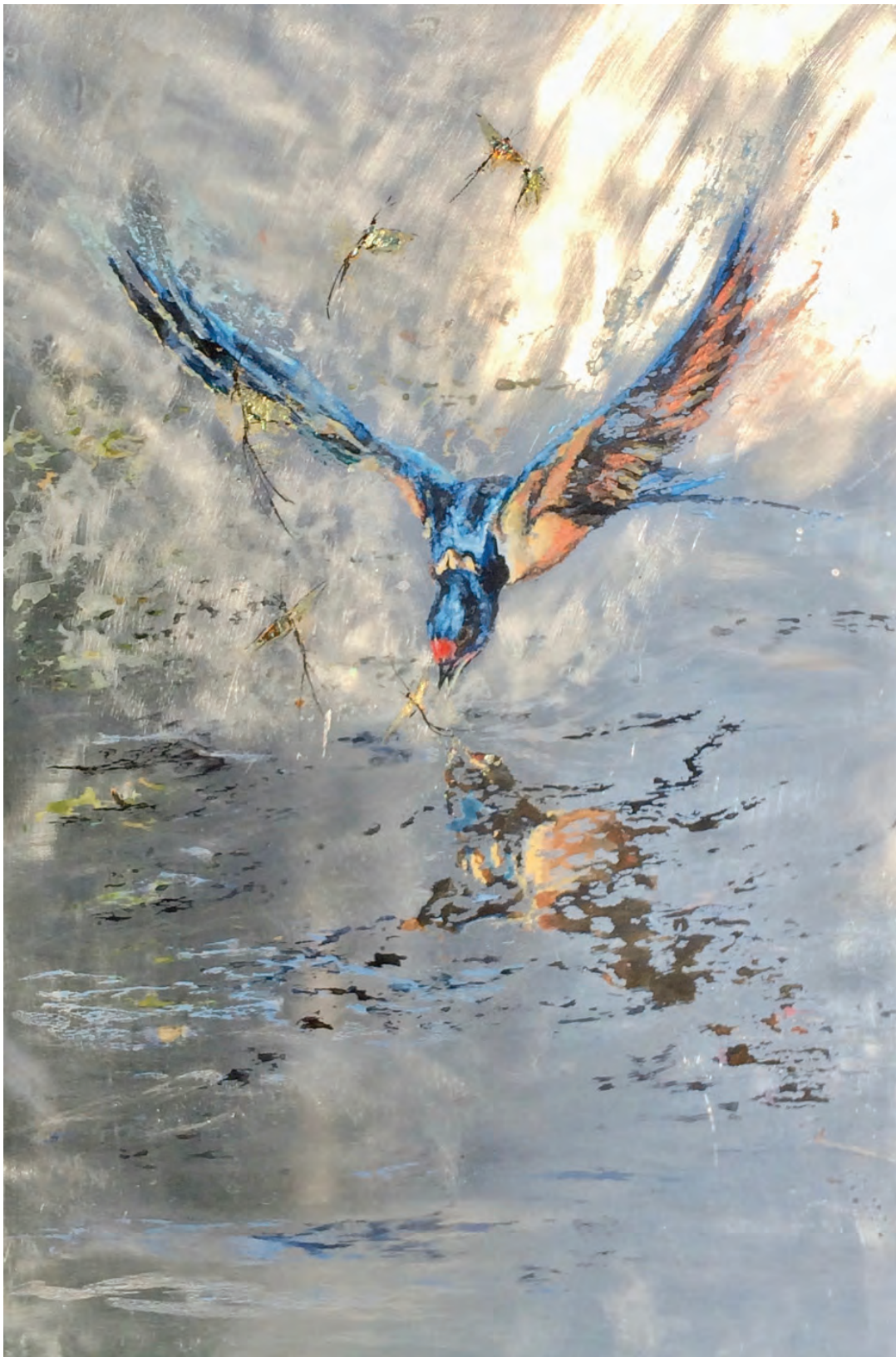
'Food on the Go' – Watercolour, precious metal and metal leafing on aluminium Sally Leggatt