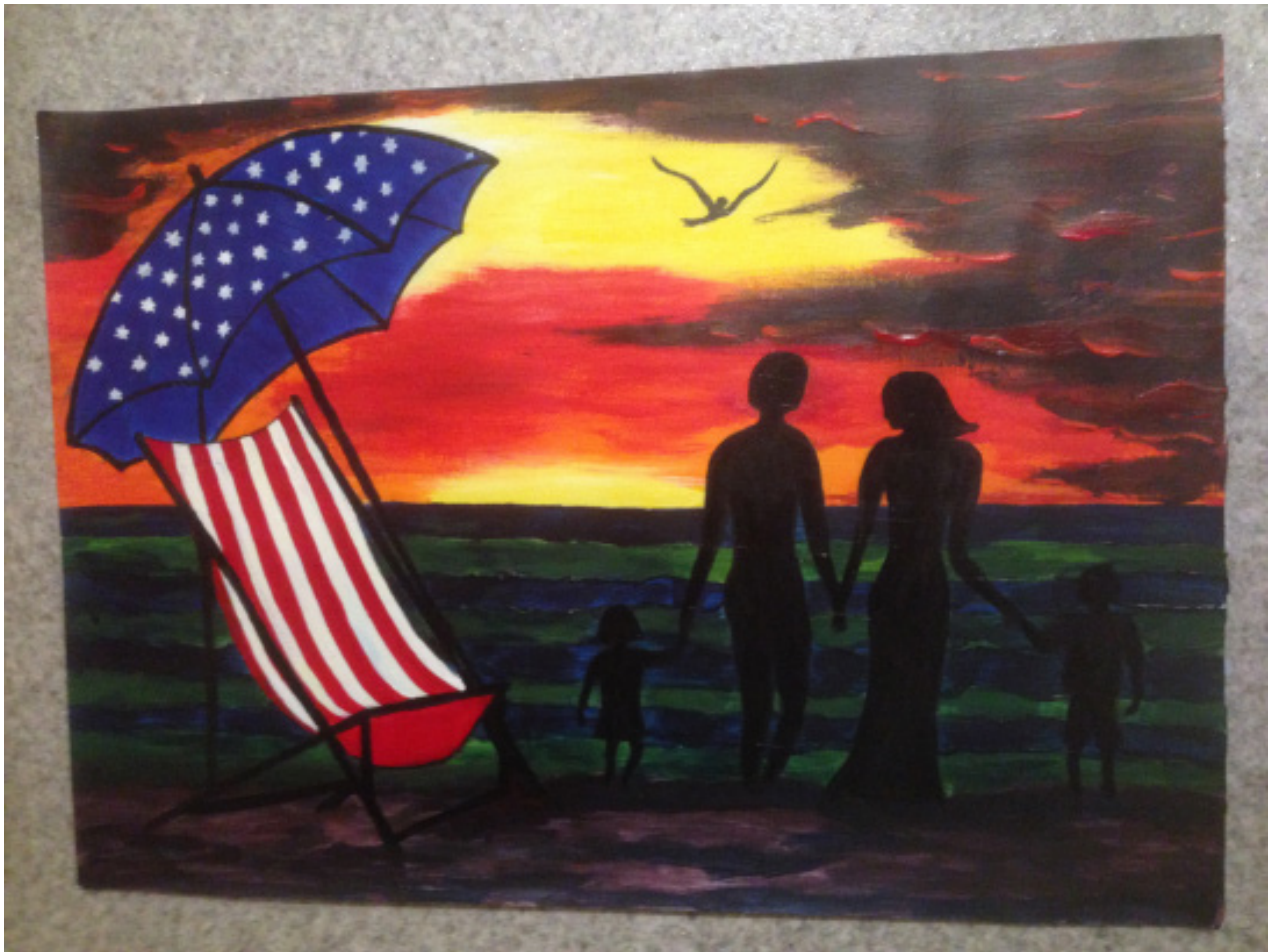
'Hopes and Fears' – Acrylics Isobel Cherry