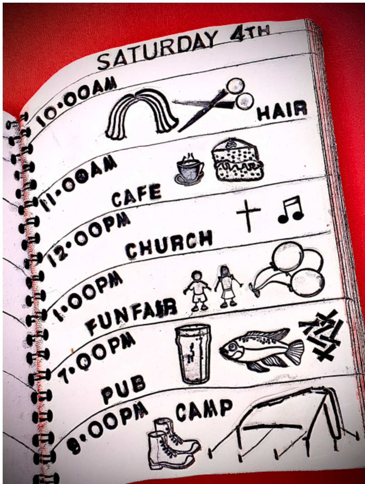
'Historic' (!) diary – Ceramic fired to earthenware Alison Pink