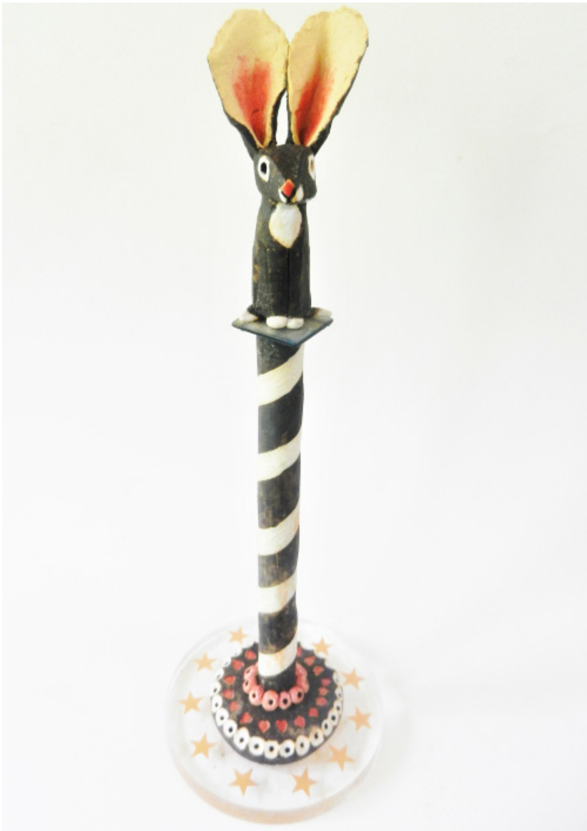
'Stars and Stripes' – Ceramic Stoneware / Perspex base Hilary Audus