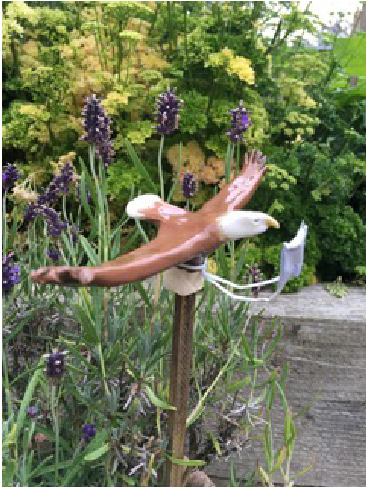
'American Eagle (with mixed media Covid mask)' – Glazed stoneware Sally Foan