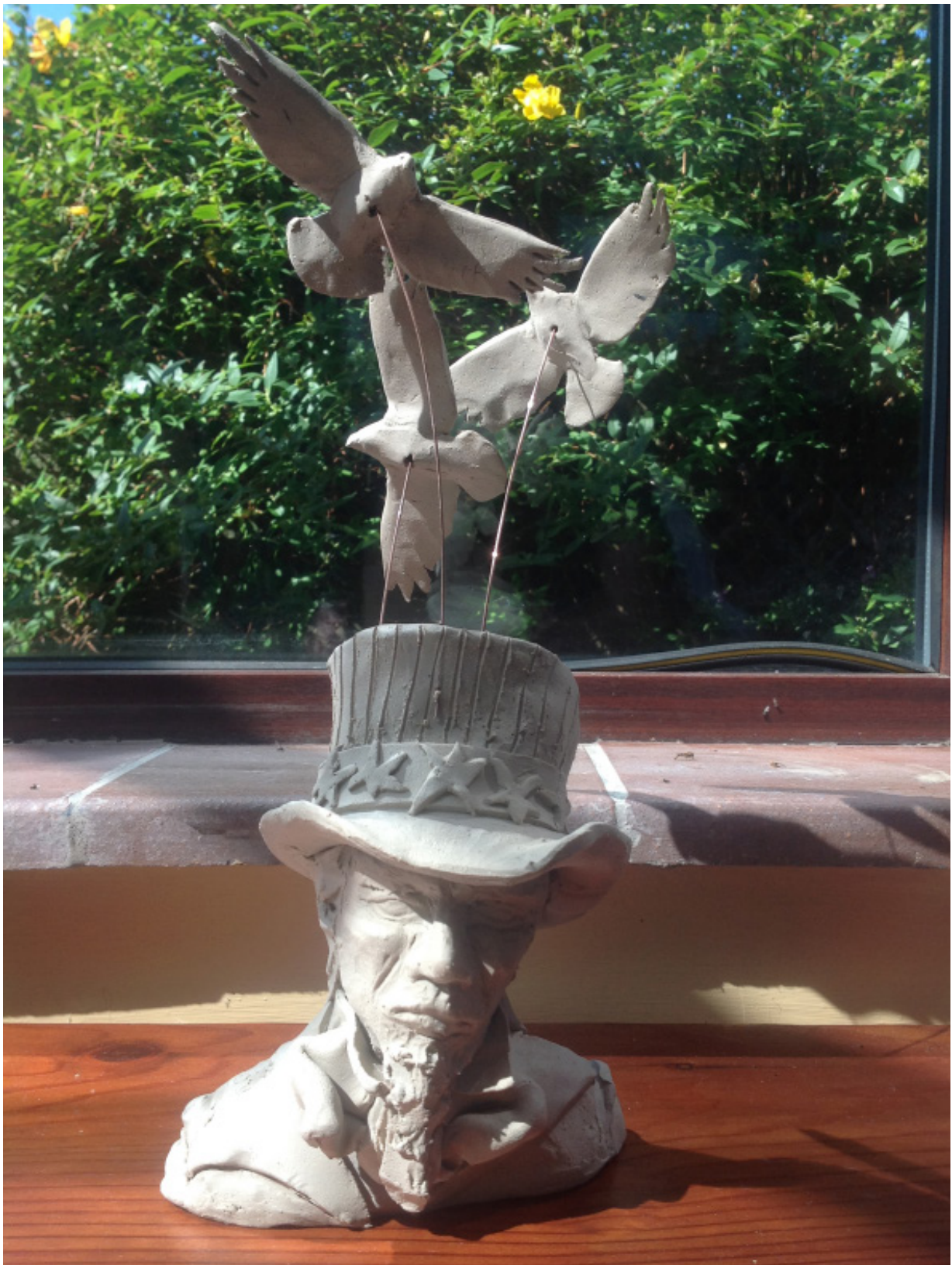
'Uncle Sam!' – Unfired stoneware 30x15x10cm Archie Morton