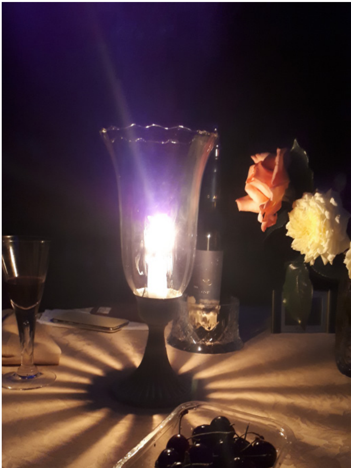
'A Glow of Hope?'