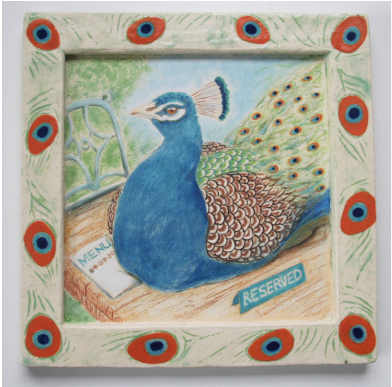
'Wildlife Takes Over Our Lives' – Stoneware framed tile, 23x23cm Yvonne Cornes