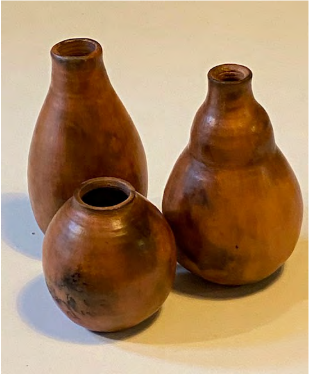
'Roman inspired smoke fired vessels' – Terracotta burnished, bisque fired and then smoked Jane Ostler