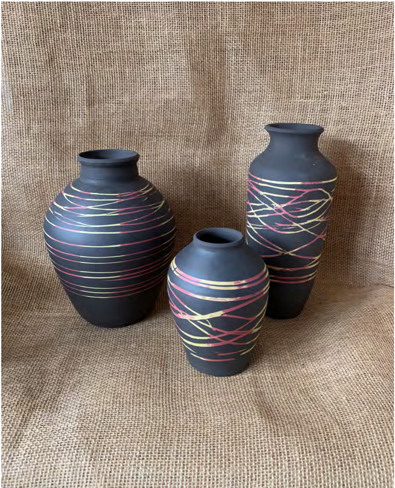
'African vases' – Black clay with inlaid red and yellow slip Adam Hoyle