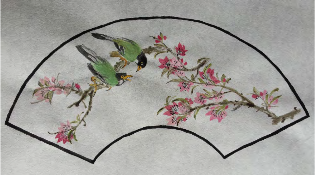
'Design for a fan' – Chinese watercolour on rice paper Pamela Wood