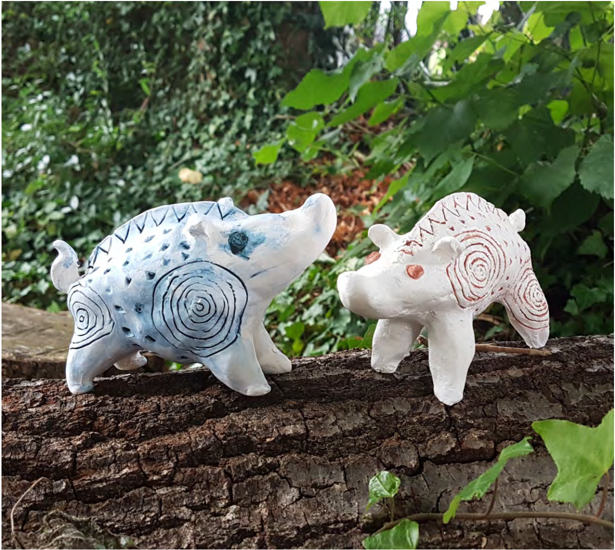
'Boars' – Hollow Earthenware with colbalt and red iron inlay Holly Inglis