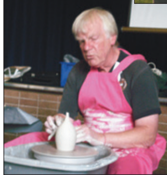
Below: May 2011 during his demo at Bucks Potters