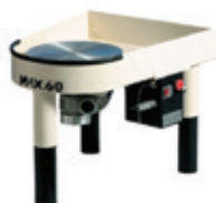
"For the beginner and expert in ceramics & pottery"