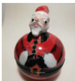
Above: The winning entries in order from first to third