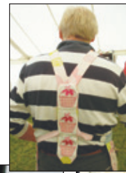
Left and below: At Art in Clay, 2012