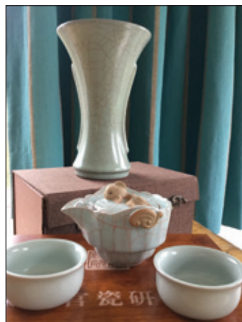
Here is the pottery I was sent in return.