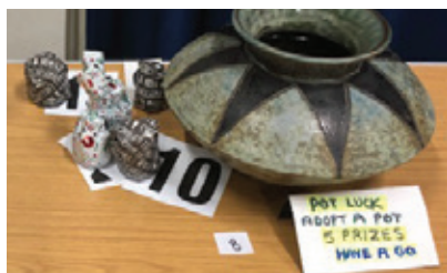
Max's 'Pot' luck entry