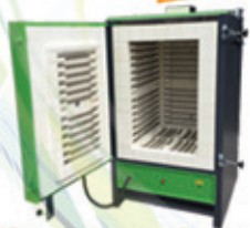
"Our UK manufactured Wheels & Kilns"

Roderveld wheels, equipment & POTTERYCRAFTS kilns are built by our dedicated team to an exceptionally high standard at our warehouse in Stoke-on-Trent, England.