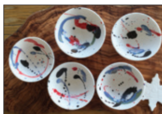
These are my little bowls

To the right is the pottery I was sent in return. These celadon pieces have an amazing crackle effect, with what appears to be the red of the clay coming through. I don't know how it is achieved – my friend was told it is a naturally occurring effect. Fascinating!