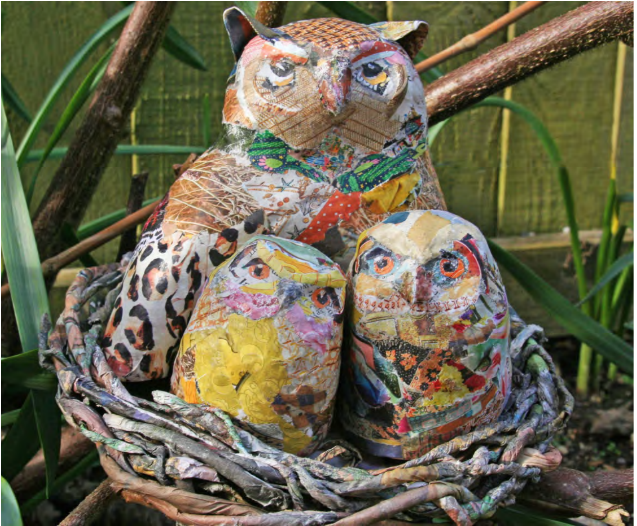
'Recycled Owls & Nest' – Papier Maché & Découpage owls and nest from old newspapers, magazines & paste Yvonne Cornes