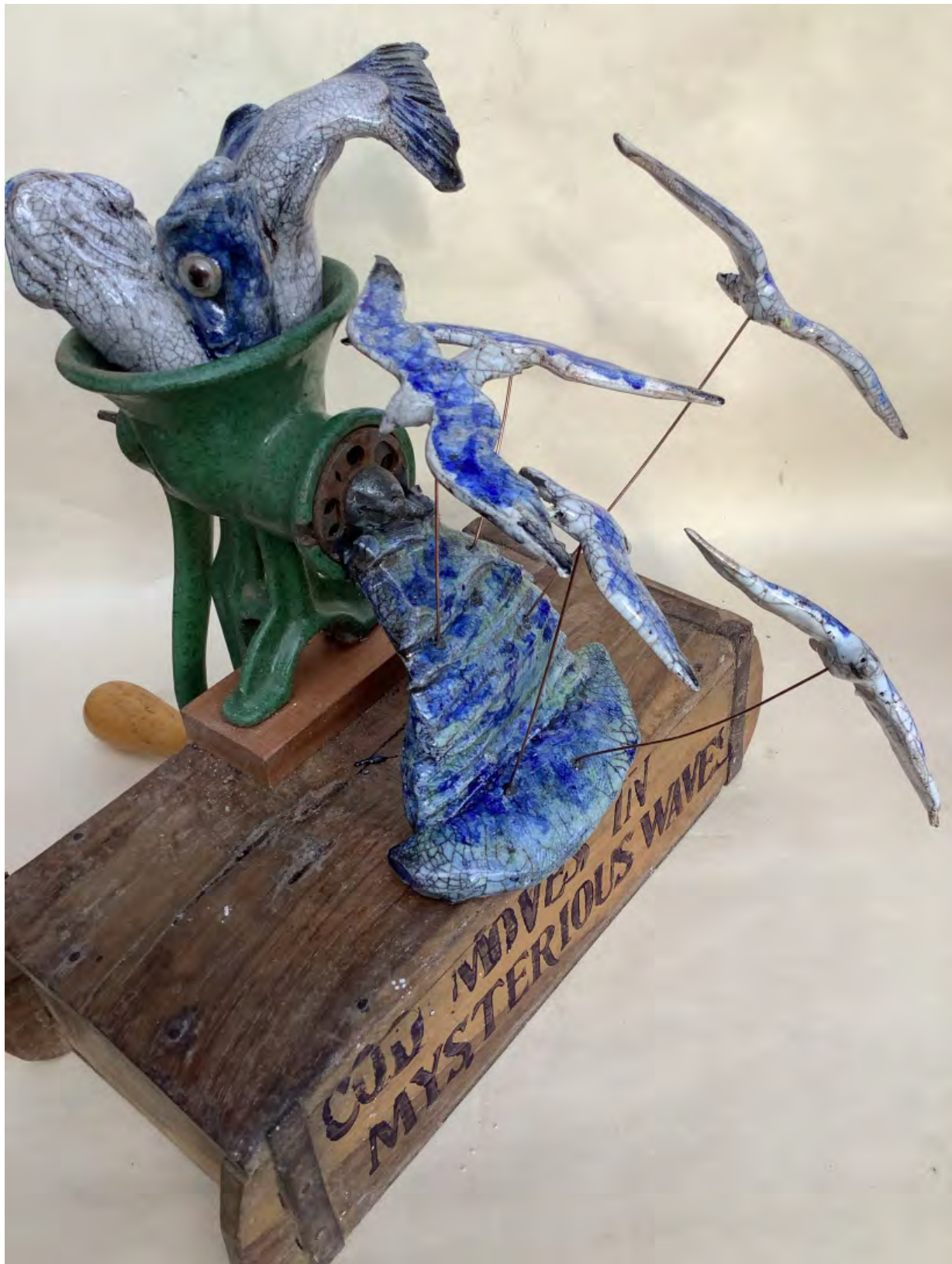
'Cod moves in mysterious waves' – Recycled saying, recycled clay, recycled meat grinder & recycled brick mould Richard Ballantyne