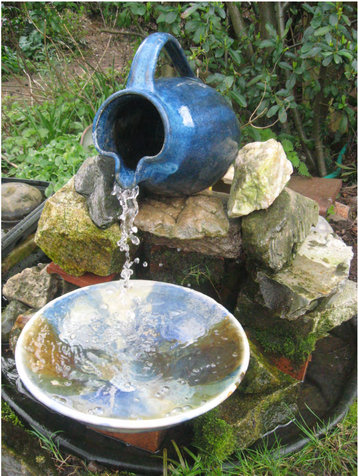
'Bowl and Jug recycled as bird bath water feature' – Stoneware clay Maxwell Cowlin