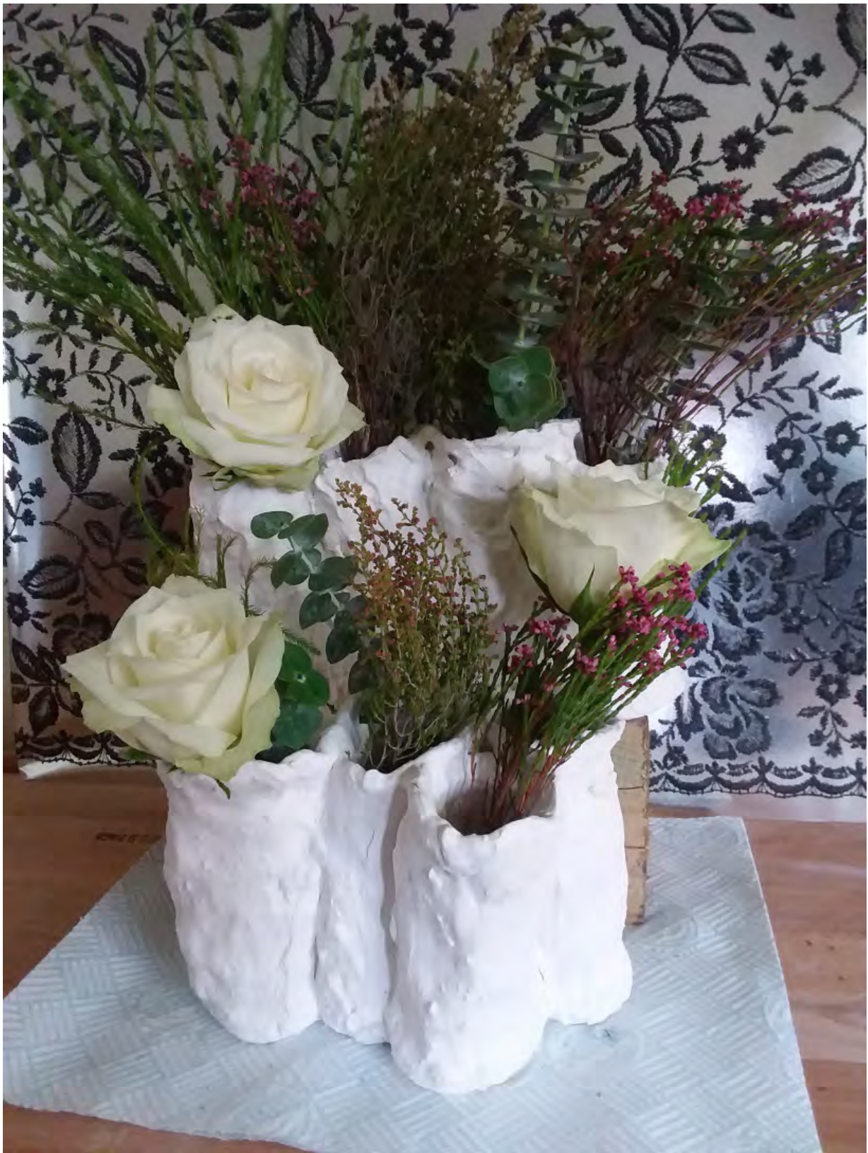
'Recycled Porcelain Paper Clay Vases' – Hand moulded vases from left over clay, roughly coiled, pressed together, dried and fired Coral Slade