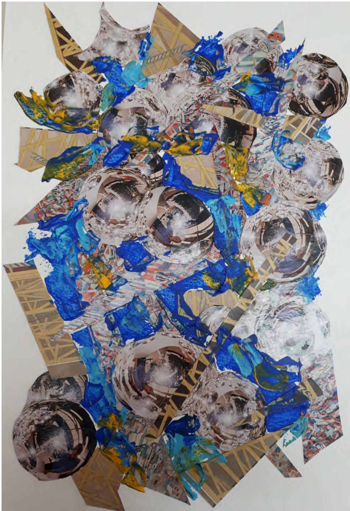
'Cosmic Debris' – Old tubes of acrylic paints, old magazines and a dash of PVA Colin Wood