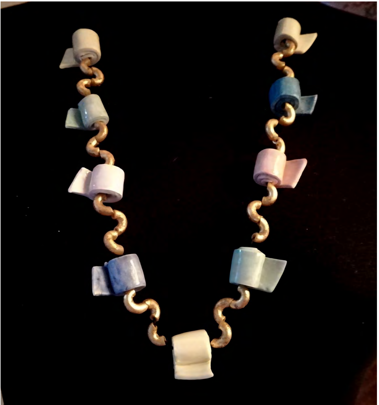
Pandemic Necklace 'These Precious Things' – Ceramic Loo rolls and gold leaf on macaroni Dorothea Reid