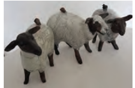
Cat Oakley sent in her charming raku sheep, each with a bird on its back.

A list of members (names only) has been sent to them, to make verification easier for them. You will need to set up a PotteryCrafts account to enable them to set up the discount for you.