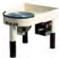
"For the beginner and expert in ceramics & pottery"