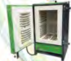
"Our UK manufactured Wheels & Kilns"

Roderveld wheels, equipment & POTTERYCRAFTS kilns are built by our dedicated team to an exceptionally high standard at our warehouse in Stoke-on-Trent, England.