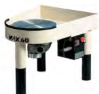
"For the beginner and expert in ceramics & pottery"