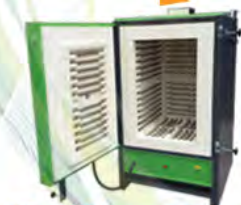
"Our UK manufactured Wheels & Kilns"

Roderveld wheels, equipment & POTTERYCRAFTS kilns are built by our dedicated team to an exceptionally high standard at our warehouse in Stoke-on-Trent, England.