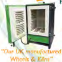
"Our UK manufactured Wheels & Kilns"

Roderveld wheels, equipment & POTTERYCRAFTS kilns are built by our dedicated team to an exceptionally high standard at our warehouse in Stoke-on-Trent, England.