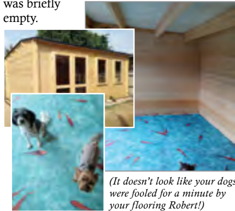
(It doesn't look like your dogs were fooled for a minute by your flooring Robert!)

In recent days I've finally finished constructing my new insulated studio space 12'x16' & hauled everything out of storage. These pics are from while the studio space was briefly empty.