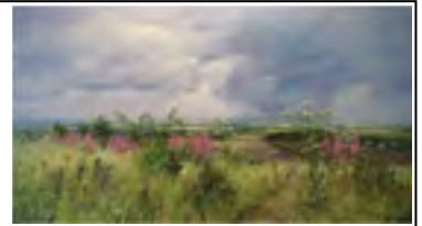
Oncoming storm by Brian Bennett (2017)

Landscapes by Brian Bennett at 95 and scenes from the museum's art collection.