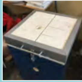
Phoenix 51 Hobby Kiln (51 litres)

Unused clay, glazes and potter's tools are thrown in.