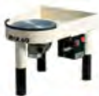
"For the beginner and expert in ceramics & pottery"